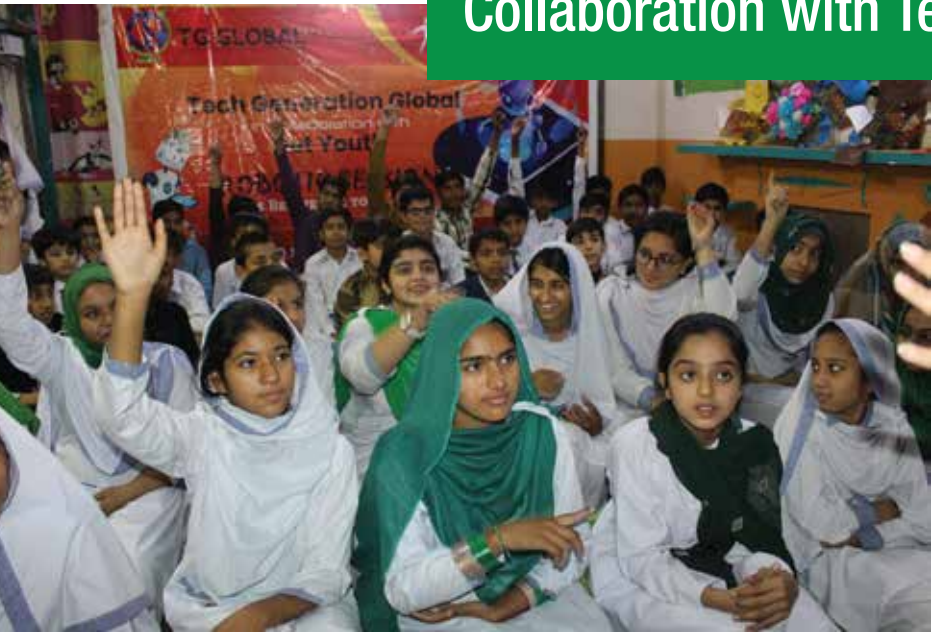
Robotics Session at Chanar School in Collaboration with Tech Generation Global